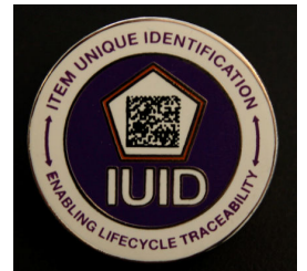
IUID emblem, source: IUID project managment. of DoD