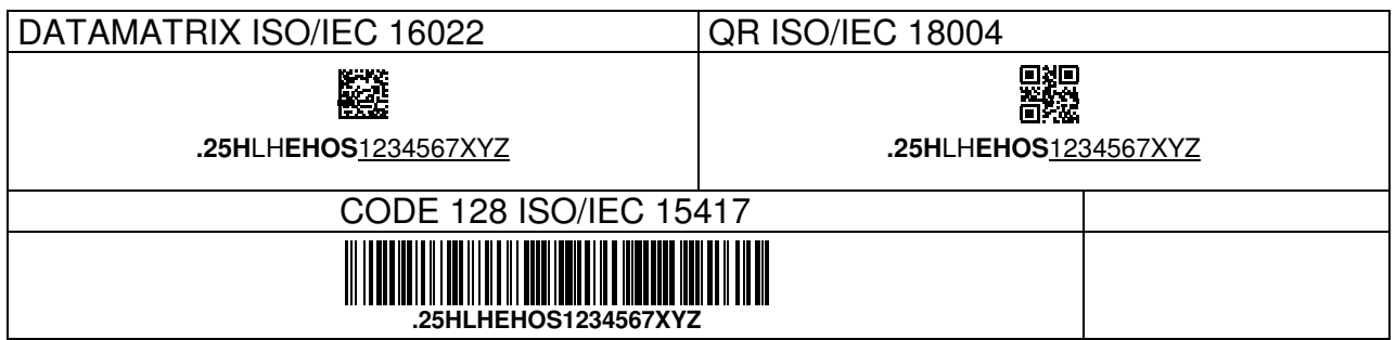
Figure 2) Same data, 3 different codes for same purpose

Figure 2) shows the unique data element for a wrist band " 25H LH EHOS <u>1234567XYZ</u>" encoded with 3 different symbols: Code 128, DATAMATRIX and QR Code.